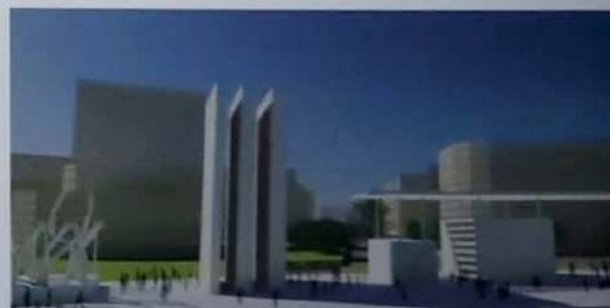
MO-OF and PK Das & Associates